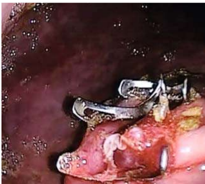
► Fig. 4 Gastric access closed with two over-the-scope clips.