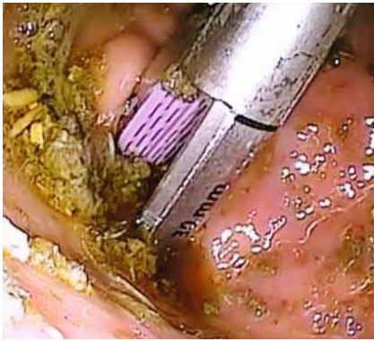
► Fig. 2 Pyloromyotomy with laparoscopic staple assistance.