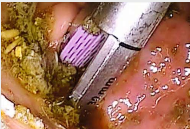
► Video 1 Pyloromyotomy with laparoscopic staple assistance.

DOI https://doi.org/10.1055/a-0985-3995 Published online: 2019 Endoscopy © Georg Thieme Verlag KG Stuttgart · New York ISSN 0013-726X