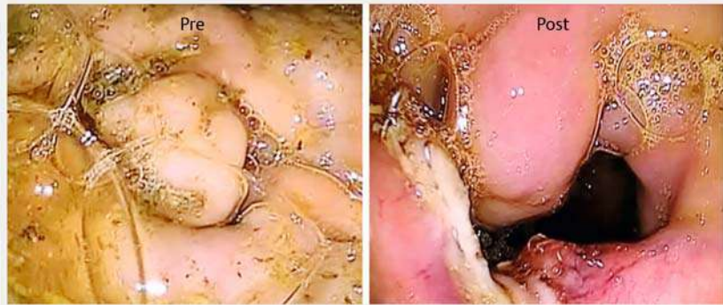
► Fig. 3 Pre- and post-procedure pylorus images.