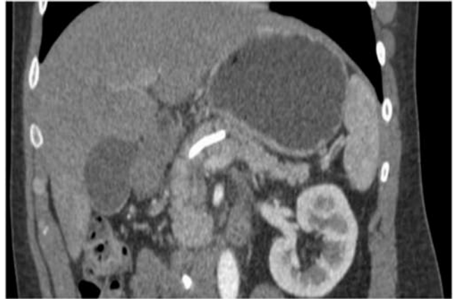
FIGURE 4 – Abdominal CT showed complete resolution of the pancreatic fluid collection

On the 30 th post-drainage day, a new abdominal CT showed complete resolution of the pancreatic collection (Figure 4). The patient is currently on two months follow-up and remains asymptomatic. An ERCP is planned on the 3 rd month evaluation for removal of the pancreatic stent.