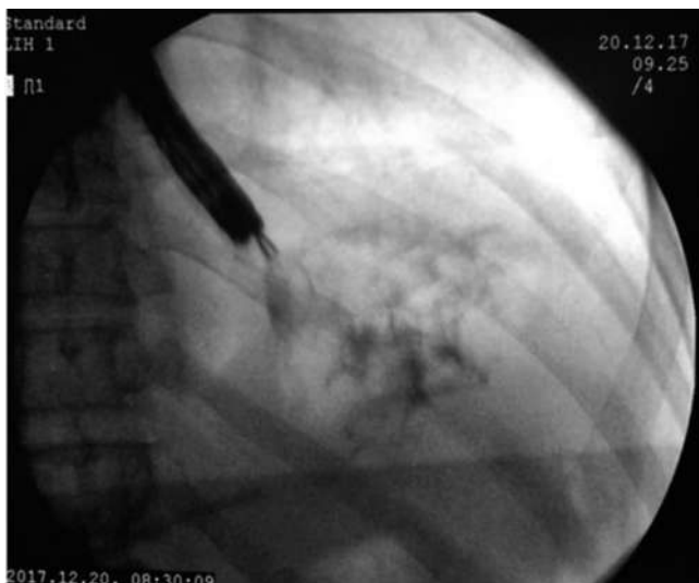
FIGURE 3 – Hot-AXIOS™ removed using a foreign body forceps

On the 14 th post-drainage day, we performed another upper endoscopy and an ERCP for assessment of the main pancreatic duct. Firstly, we tried to introduce a typical gastroscop through the stent but it was not possible due to the complete collapse of the prosthesis. Then, we instilled contrast through the stent and we notice complete reflux back to the gastric chamber, confirming the complete collapse of the collection. Pancreatography revealed a stricture in the transition of the head and neck but no fistula. We performed a pancreatic sphincterotomy and placed a 7F x 10 cm straight plastic stent through the stricture. After deployment of the pancreatic stent, we removed the Hot-AXIOS using a foreign body forceps (Figure 3). The patient was asymptomatic and was discharged 24 h after the ERCP procedure.