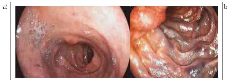
Figure 2. a) Duodenal changes in gastrointestinal ischemia. Edema, purplish, pale, mottled appearance of the mucosa. b) Duodenal second portion changes in gastrointestinal ischemia. Edematous, friable, purplish colored with mottled appearance mucosa.

implying hepatic insufficiency, necrosis, gangrene, ulcers, oliguria and azotemia (13,14) .