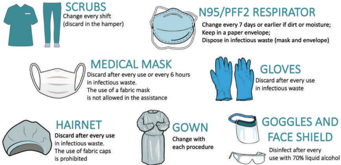
Figure 6 - PPE Disposal Suggestion. According to Hospital das Clínicas da Faculdade de Medicina da Universidade de São Paulo (HCFMUSP) recommendations. Abbreviations: PPE, personal protective equipment.

in a sealed box, and send it to the appropriate area for high-level disinfection (12).