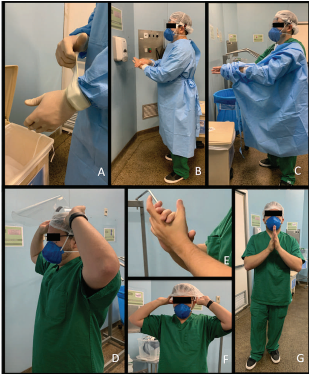
Figure 4 - Guidance on Removing PPE to be used by Healthcare Professionals during Endoscopic Procedures for Patients with Confirmed/Under Investigation for COVID-19. After the procedure, the professional should go to the dressing room (donning/doffing room) and: A. remove gloves; B. hand hygiene; C. remove and discard gown; D. remove face shield and goggles; E. hand hygiene; F. discard hairnet and put on a new one; and G. hand hygiene. After these steps, the healthcare professional may leave the surgical center and enter the locker room. Abbreviations: PPE, personal protective equipment; COVID-19, coronavirus disease 2019.

Each team consists of a physician assistant, one nursing technician, and one fellow. The scale is divided into 24-hour shifts. HCP on the COVID team are not assigned to more than 24 hours/week, with an interval of at least 1 week between shifts from COVID to non-COVID teams. These administrative measures were designed to prevent long exposure times and cross-infection.