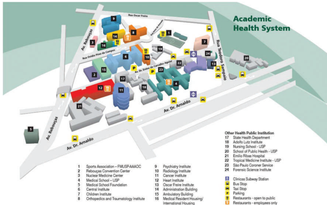
Figure 1 - The Hospital das Clínicas da Faculdade de Medicina da Universidade de São Paulo (HCFMUSP) Complex.