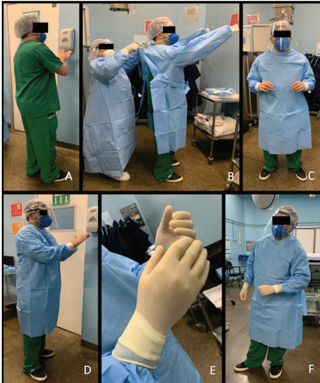
Figure 3 - Guidance for Donning PPE to be used by Healthcare Professionals during Endoscopic Procedures for Patients with Confirmed/ Under Investigation for COVID-19. First, the healthcare professional dons scrubs, closed and waterproof shoes, N95 or PPF 2 mask, and hairnet in the locker room. Only then should the healthcare professional enter the surgical center. Before entering the operating room, the healthcare professional must wear PPE in the dressing room (donning/doffing room): A. hand hygiene; B. don the long-sleeved waterproof isolation gown; C. put on goggles and face shield; D. hand hygiene; and E. put on gloves that fully cover provider's wrist. F. The healthcare professional may now enter the operating room. Abbreviations: PPE, personal protective equipment; COVID-19, coronavirus disease 2019.